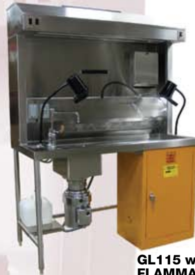
GL115 w/OPTIONAL FLAMMABLE CABINET